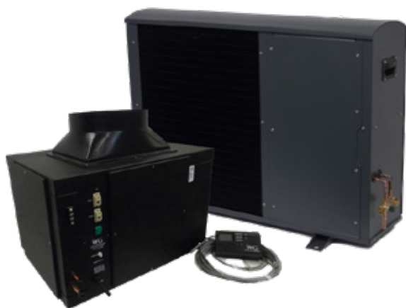
Wine Guardian Evaporator (L) and condensing unit (R) (DS025, DS050, DS088, WGS40, WGS75, WGS100 only)