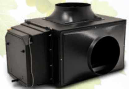
Ducted split system with optional, integrated humidifier