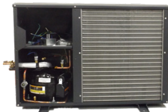
DS025, DS050, DS088, WGS40, WGS75, WGS100 Condensing unit with easy-access cover

*Condensing unit is patented US Patent No. D791294 EU Patent No. 003189349-0001